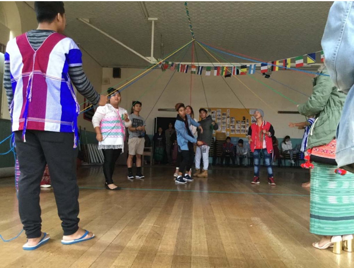
Dance practice in the church hall