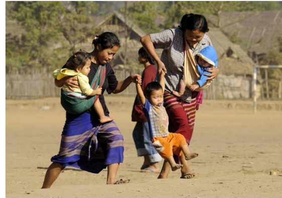
Mothers and their children, Nu Po refugee camp, Thailand.