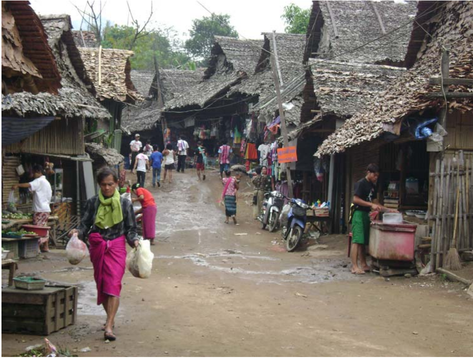
Karen area of a refugee camp on the Thai border