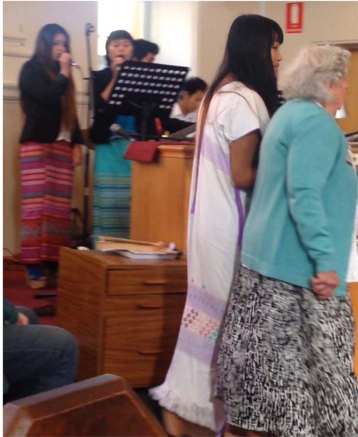
Mother's Day - unmarried girls honor mothers by escorting them to the stage to receive a flower and gift.

Girls in the Australian Karen youth costume