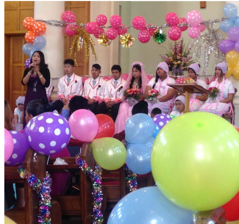
Wedding in the chapel