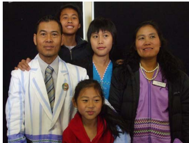
[db; unDzd Hobart Karen est. 2007

Karen refugee movement to the Thai-Burma border The Economist, 22 March 2014.