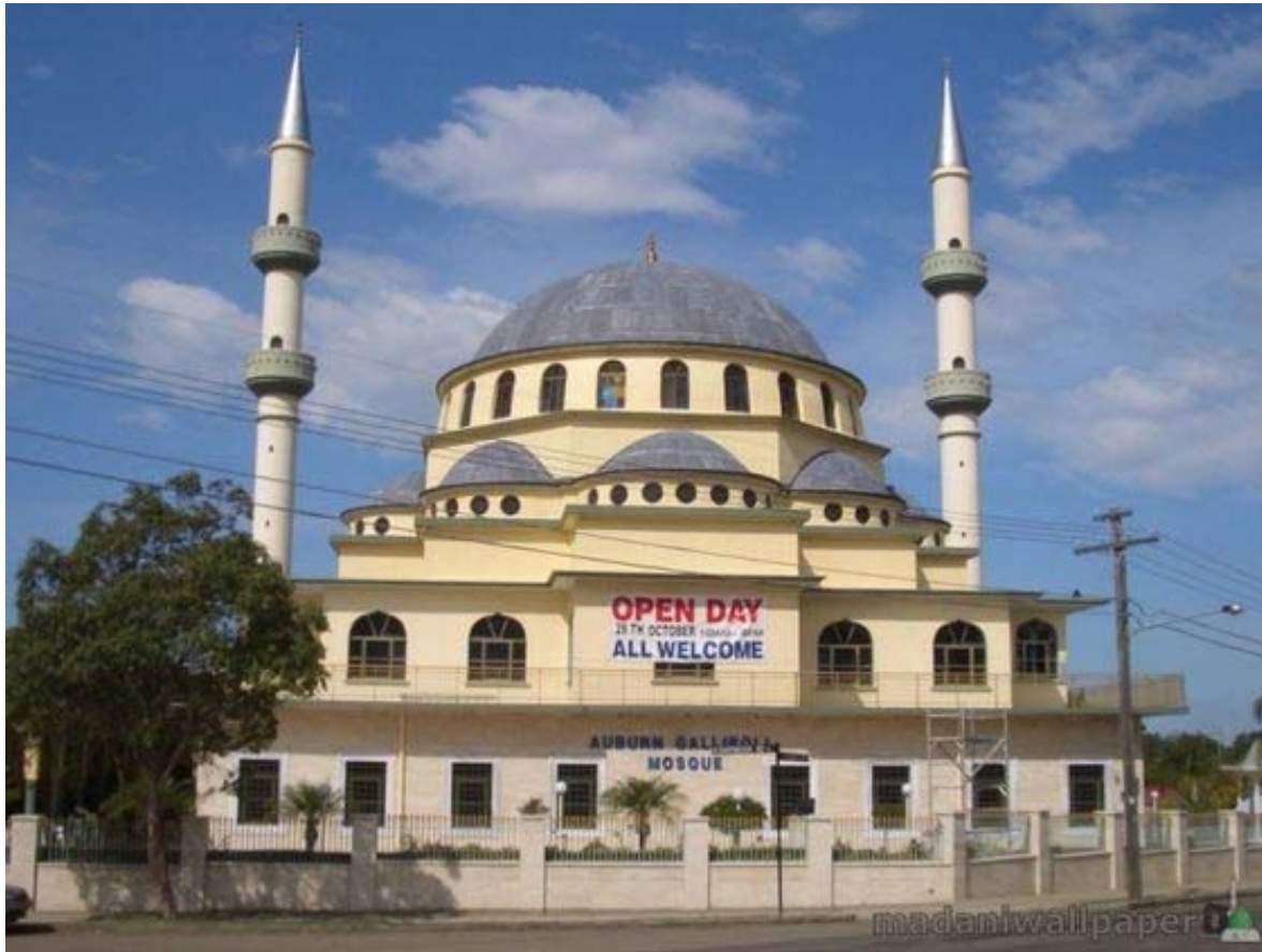
Mosque in Sydney

Anthropology is not an experimental science in search of law but an interpretive one in search of meaning (Geertz (1973/1993: 5)