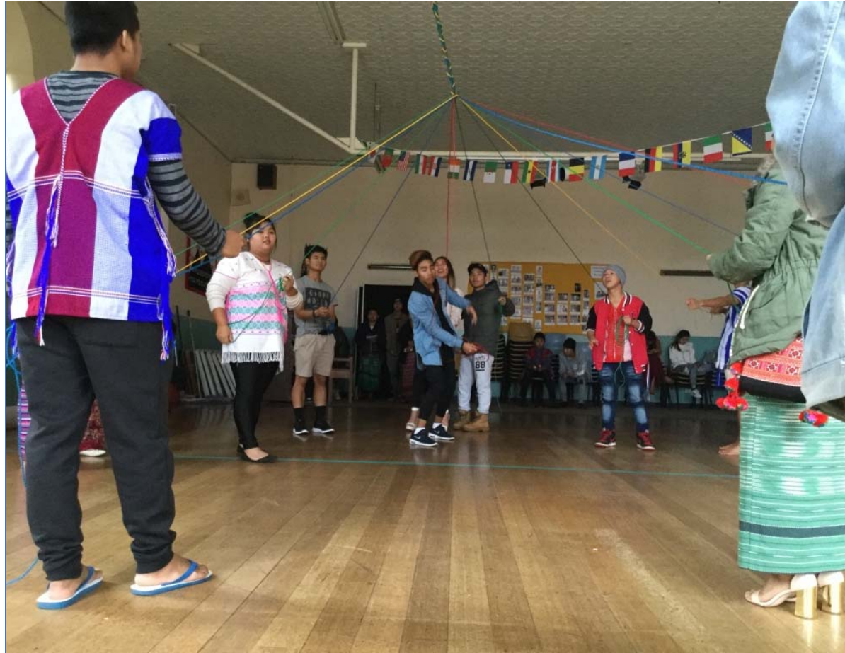
‘unity dance’ practice in the hall